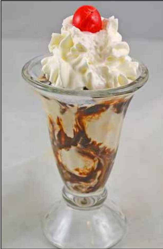
Ice Cream Sundae

A vanilla ice cream sundae topped with your choice of strawberry, caramel or chocolate plus whipped cream & a cherry - 5.99