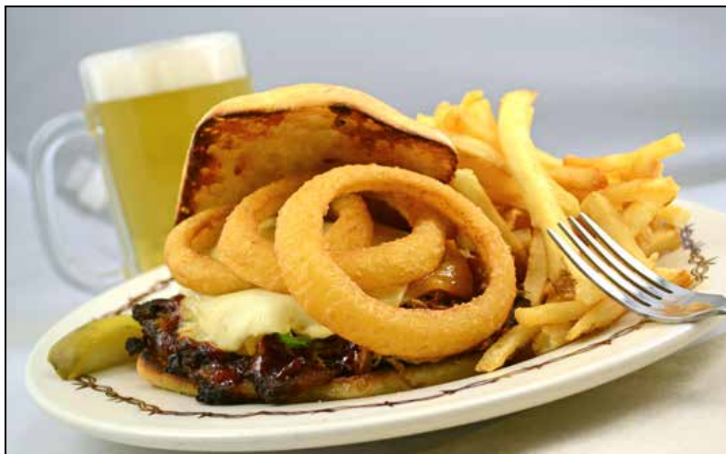
“The Duke” Sandwich

Sliced beef brisket & pulled pork topped with pepperjack & cheddar, onion rings, jalapeños & Smoky Bacon BBQ Sauce - 17.99 •Order with no onion rings & BBQ Sauce•