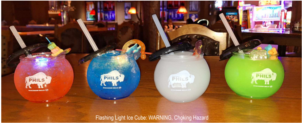
Flashing Light Ice Cube: WARNING, Choking Hazard

Specialty kids drinks are served in a souvenir fishbowl with a light up ice cube you can keep!