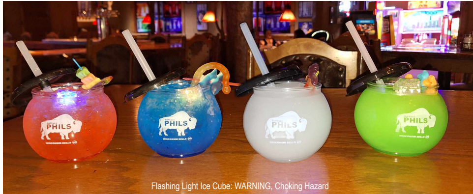
Flashing Light Ice Cube: WARNING, Choking Hazard

Specialty kids drinks are served in a souvenir fishbowl with a light up ice cube you can keep!